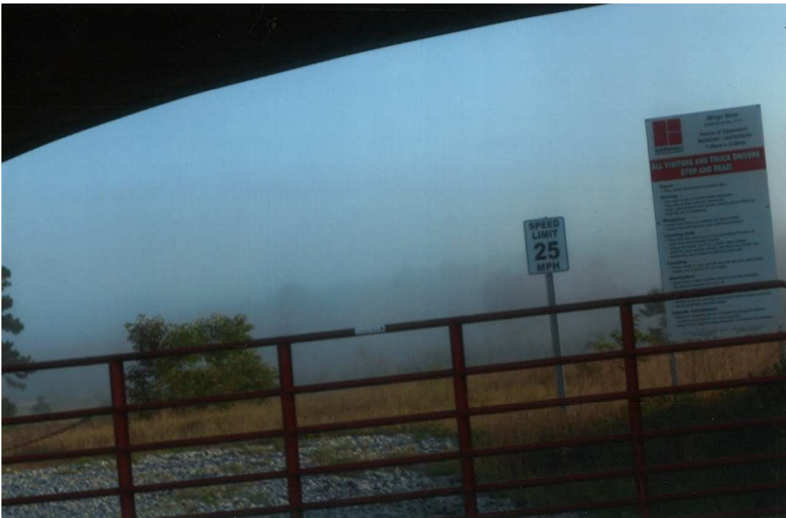
Photo F 6/16/14: Entrance of Barnhill Sand pit on Waymon Chapel Road