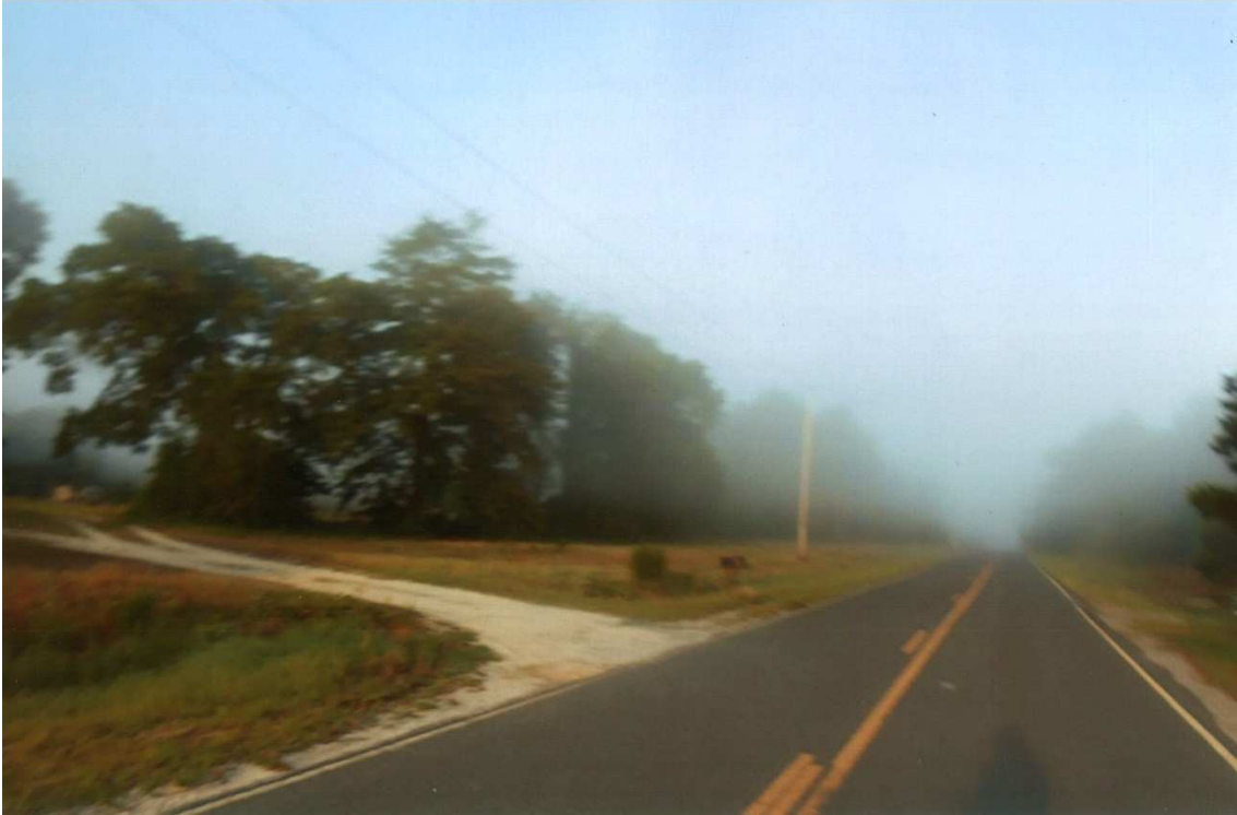
Photo U 6/16/14: Smoke from Duke Energy at the entrance to 182 Waymon Chapel Road