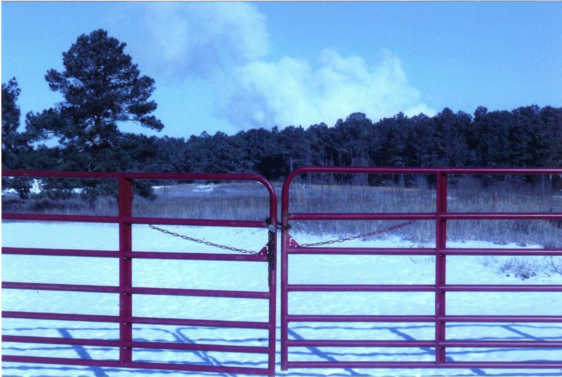
Photo E date uncertain, looking towards RCCTF from Waymon Chapel Rd.