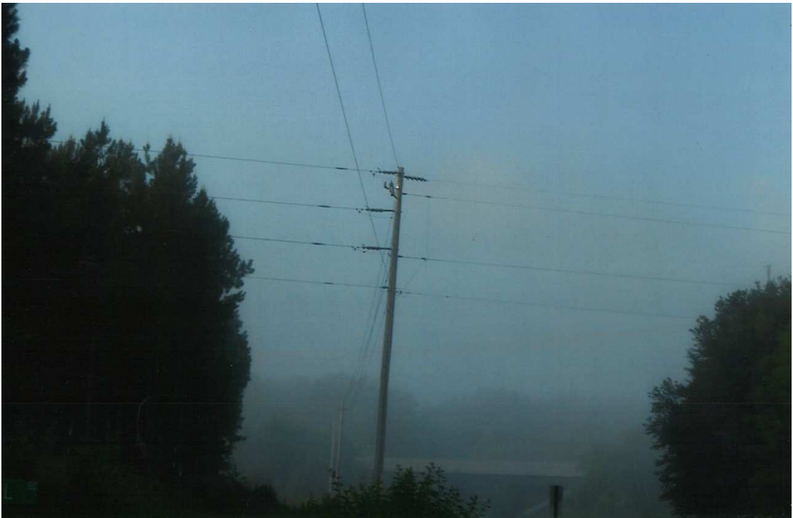
Photo J 6/16/14: Bridge down the Airport Road about 3 blocks from RCCTF